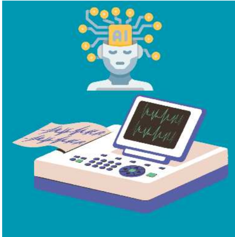
Figure 5 This image shows how healthcare has become very digitalized and imbued