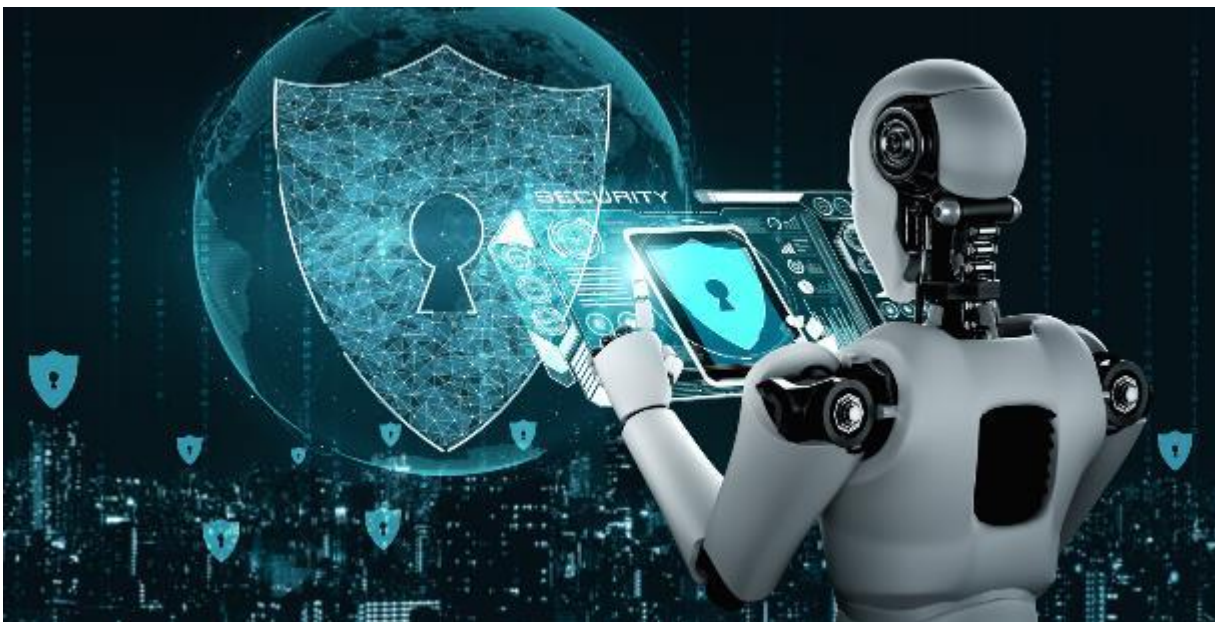
Figure 3 Image illustrates how Automated machines are able to bypass securitys at large scales.

Another form of this is in manipulating engagement metrics through the use of automotive features. People use automated machines to constantly send unsolicited communication in bulk (commonly known as spam) with different engagement metrics such as clicks or fake interactions that boost their platform and profile and ultimately spread their reach to a larger amount of people around the world. Through all these different forms of growing their reach and influence, the result is a vast amount of money brought in through sponsorships and brand deals that individuals don't deserve due to their unethical way to fame. This creates a way for people to abuse the intelligent and practical nature of machine automation to gain money and fame. This issue is also made more common as not only are these bots often found at cheaper prices with easy access, but also many smaller streamers who don't have much to lose are willing to take the risk of being caught. This is illustrated by "The 2018 annual report of Distil Networks [2] reveals that web bots account for 42.2% of all website traffic while human traffic makes up the rest 57.8%. (Xu et al.). This means that nearly half of all data is completely wasted, and any marketing and advertising teams attempting to reach people are effectively wasted due to people faking their view counts and filling their own pockets.