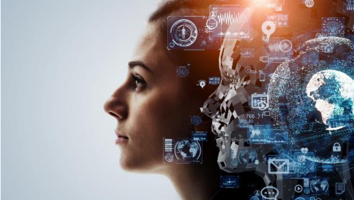
Figure 1 Image showing how AI are able to mimic human behavior and bypass biometric security standards.