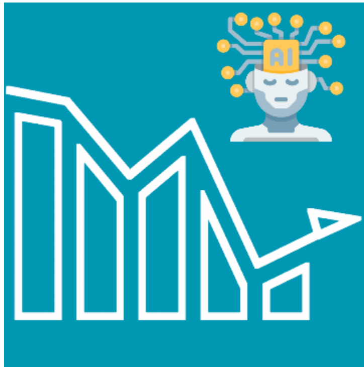
Figure 4 Image showing how financial institutions and sectors are gradually losing capital from AI-powered Cyberattacks

for 3–6 days would result in ground-up loss central estimates between US$6.9 billion and US $14.7 billion' "(Warren et al, 2018). This issue of great loss impacting a large part of a sector is made even worse due to the fact that many of these institutions are often interlinked. This means that as one of these institutions is impacted, they hold the risk of another being consequently harmed, thus leaving huge impressions upon the sector and economy as a whole.