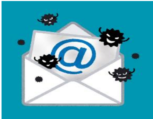
Figure 2 Image showing how through Ai powered social hacking, malicious emails can be sent and received

Forms of social hacking are another platform in which AI can be utilized to access company information. AI can train off of social data from emails, media, and conversations to create its own emails that are human-like and more likely to be accessed by a current employee of the company. Moreover, these types of AI-powered attacks can be automated. This is important as, “However, growing access to AI- and generative AI-enabled tools is allowing adversaries to automate attack research and execution”.(Stanham, 2024). This makes these attacks much more common and viable for cybercriminals to attempt. When these types of incidents occur within businesses, their reputation becomes slandered and defamed through customer trust and public perception.